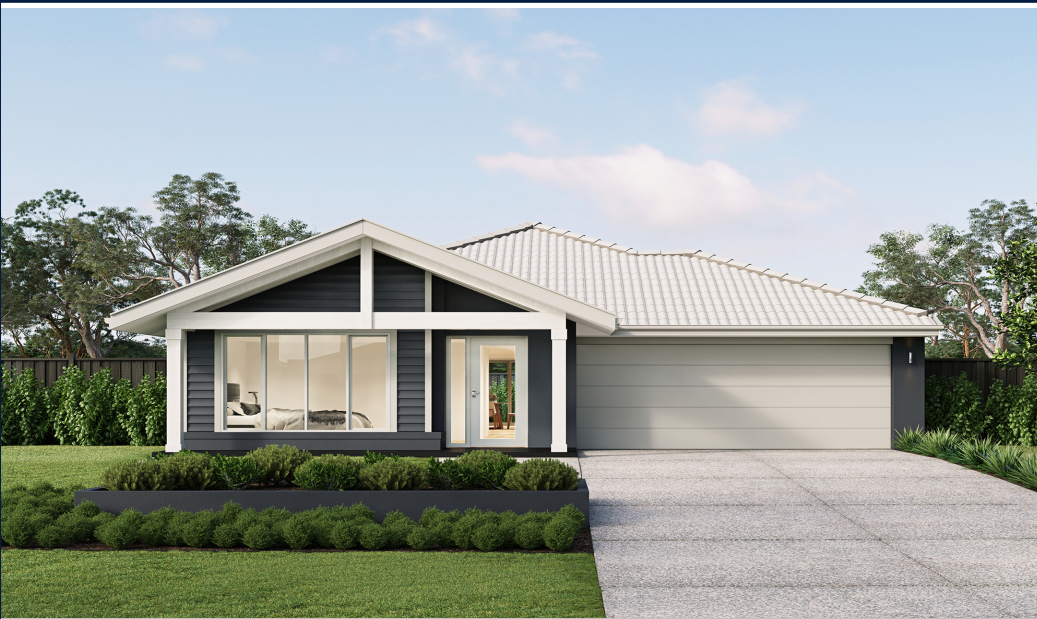
Price excludes upgrade items above standard specification such as feature render and bricks, front entrance timber decking, front entry door, brick infills above garage, external lighting, fencing, concrete paths and driveway. Façade Image may also contain items not supplied by Metricon Homes, namely landscaping and planter boxes.